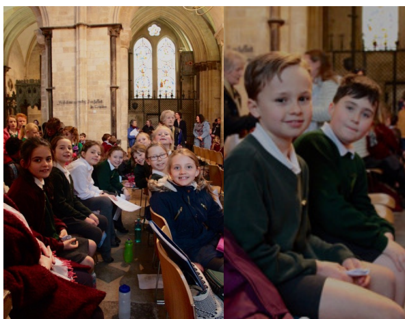
Photos from Chichester Cathedral

Consent for all trips and clubs can now be given easily online via Scopay, please let us know if you need log-in details.