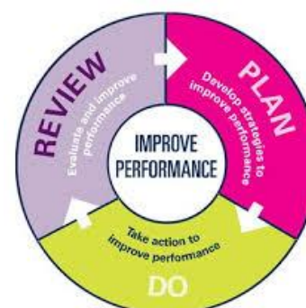
Diagram 1: Plan, Do and Review

We aim through the Trust's vision, mission and aims, the Academy's Journey to Excellence Plan and your Job Profile, to give you the tools that will help you, with your manager, to determine your journey, which will be discussed and confirmed in your own PDR Plan (PDRP).